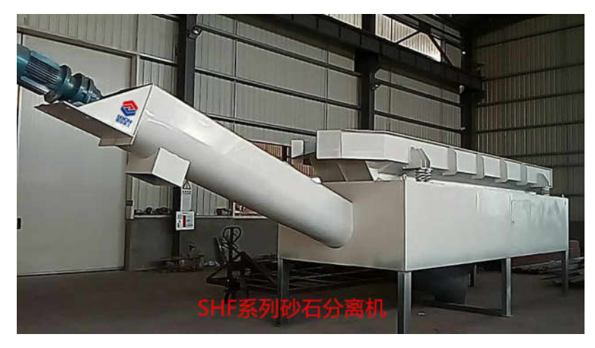
SHF Series Concrete Reclaimer

Our concrete reclaimer main model include SHF series, STF series, SYF series and LSS series. All above series are high-tech, intelligent control, environmentally friendly and low operating cost.