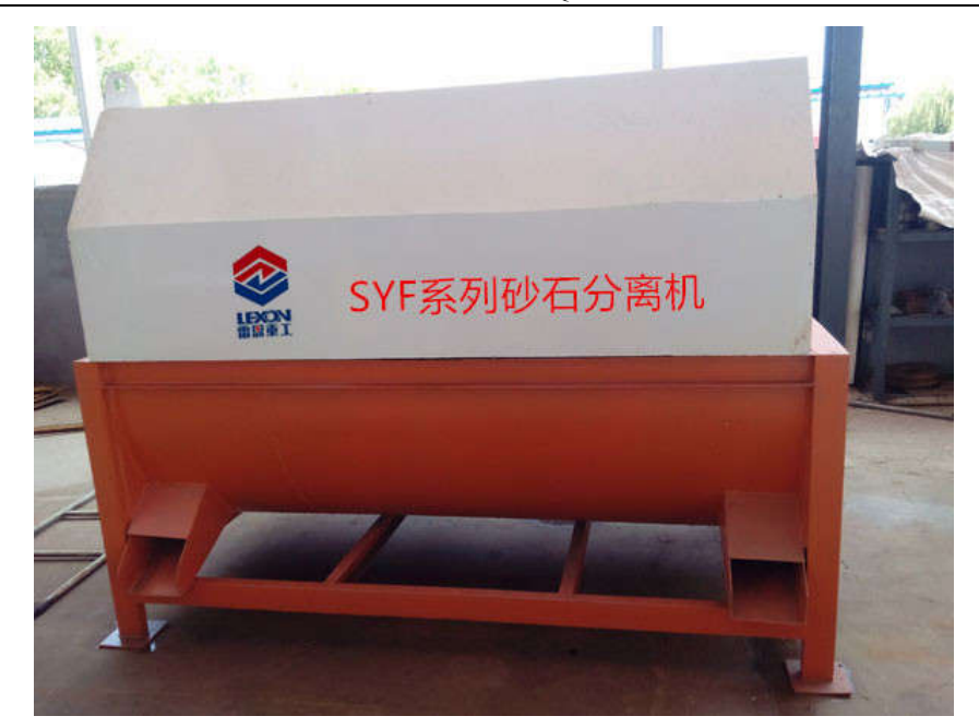
SYF Series Concrete Reclaimer